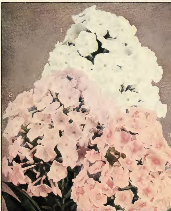
Our Hardy Phlox are all heavy, field-grown plants